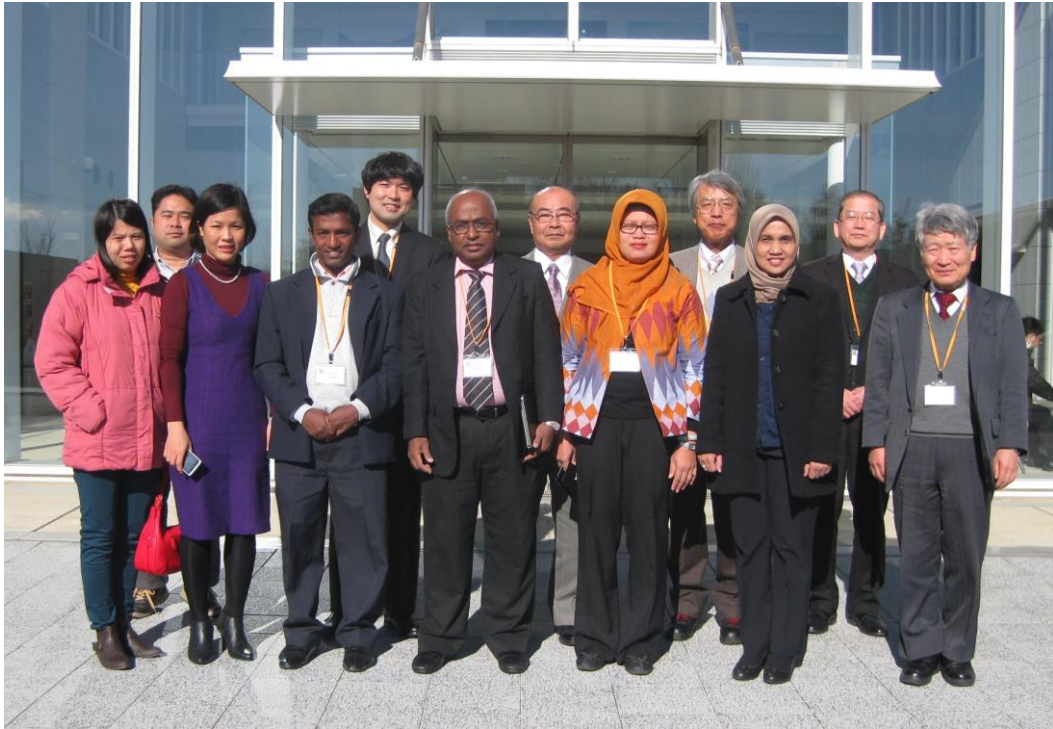
Group photo at the back entrance of ISM on 22 Dec. 2014