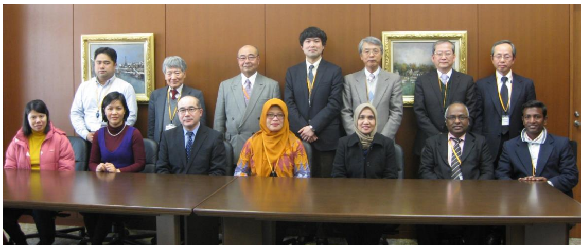
Courtesy call on the Director-General of the ISM on 22 Dec. 2014