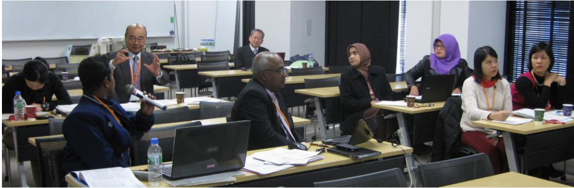
One scene of Q&A session in the Workshop on 18 Dec. 2014